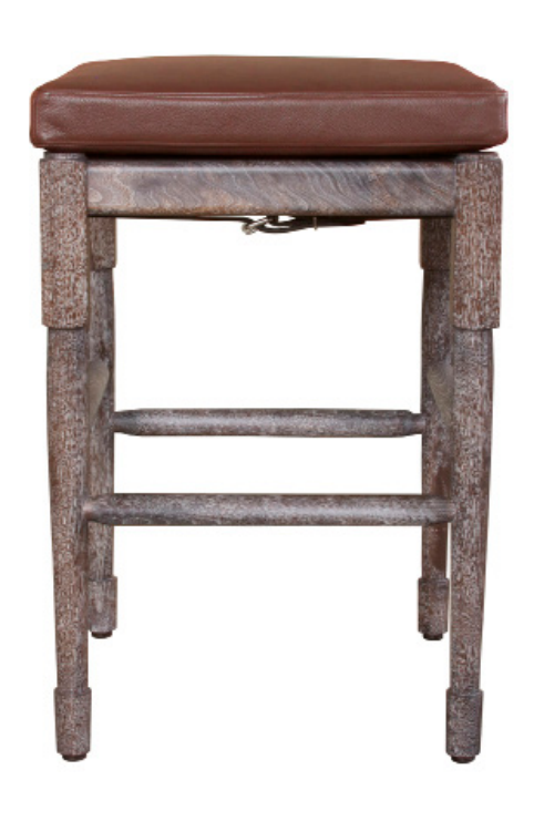
Marrakech stained and limed walnut with Moore & Giles Deer Run / Chestnut; havana English bridle leather strapping