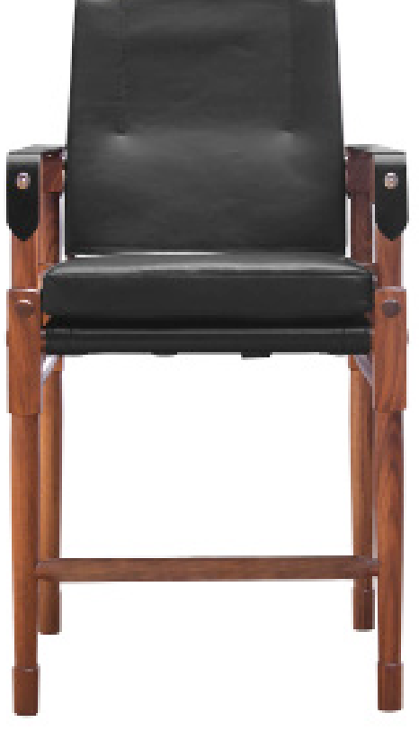
Oiled walnut with black leather upholstery and strapping