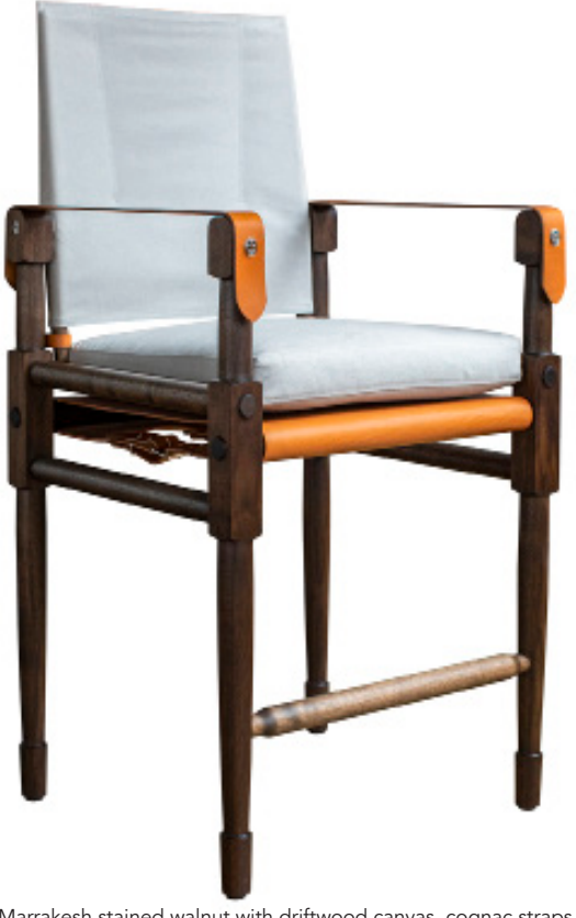
Marrakesh stained walnut with driftwood canvas, cognac straps and sling